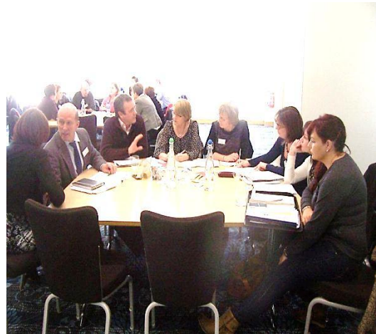
Further connecting and engagement by delegates.