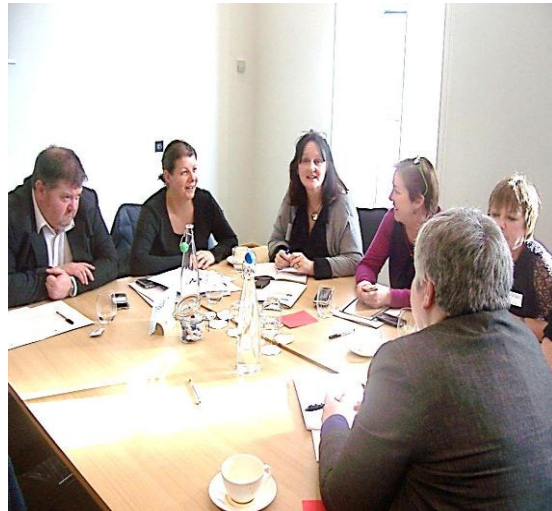
Delegates participating in group work at the event