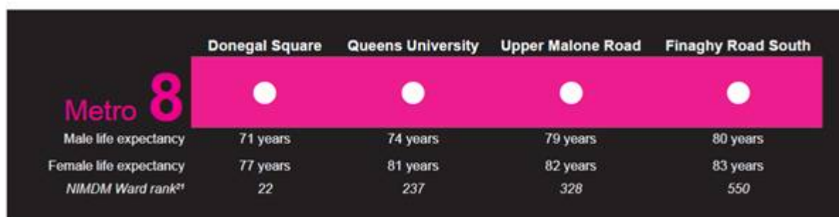
Figure 12. Life expectancy 20 at selected points along a Belfast Metro line (2006-08).