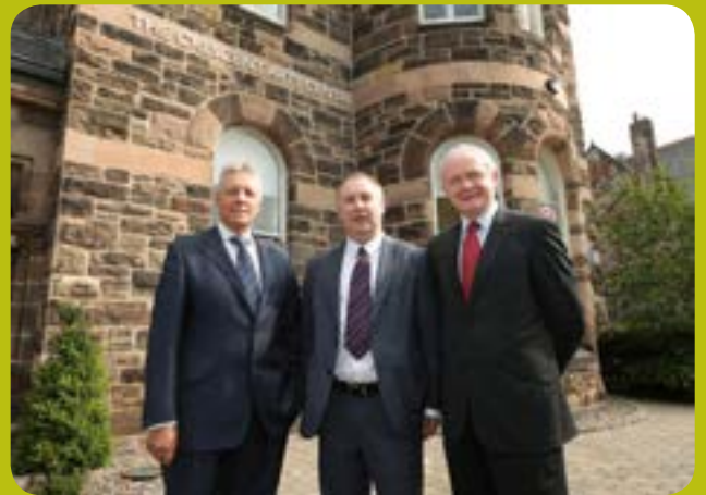
First Minister Peter Robinson, deputy First Minister Martin McGuinness with Padraic Quirk from The Atlantic Philanthropies, at the Crescent Arts Centre