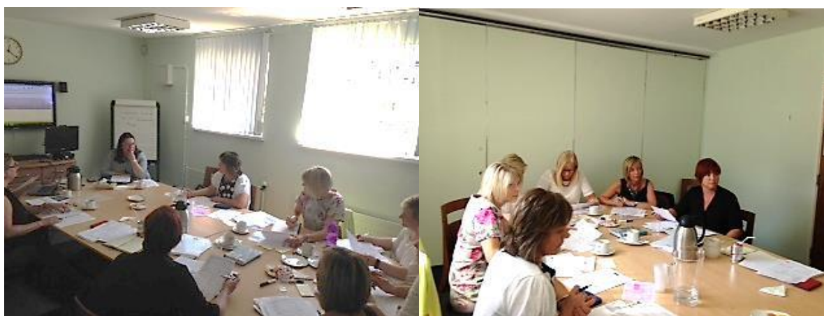
Workshop with EITP implementation managers

3+ Health Review: This is a new Health Review being introduced into the pre-school setting where Health Visitors will work in partnership with children, parents and education colleagues to promote children's social, emotional and behavioural development, providing them with information and signposting to other services where appropriate. It includes the use of an Ages and Stages Questionnaire in relation to social and emotional development of children (ASQ: SE-2).