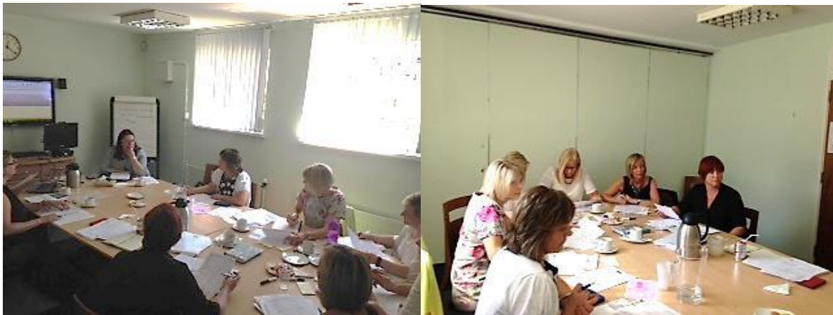
Workshop with EITP implementation managers

where appropriate. It includes the use of an Ages and Stages Questionnaire in relation to social and emotional development of children (ASQ:SE-2).