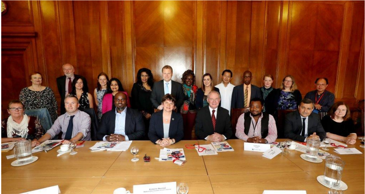
Ministers at the inaugural meeting of the Racial Equality Subgroup

A key milestone of the Racial Equality Strategy 2015-25 was reached on the 14 September when the Racial Equality Subgroup held its inaugural meeting in Parliament Buildings. The First Minister, deputy First Minister and both Junior Ministers attended the event to thank members for taking part and to wish the Subgroup well for its future endeavours.