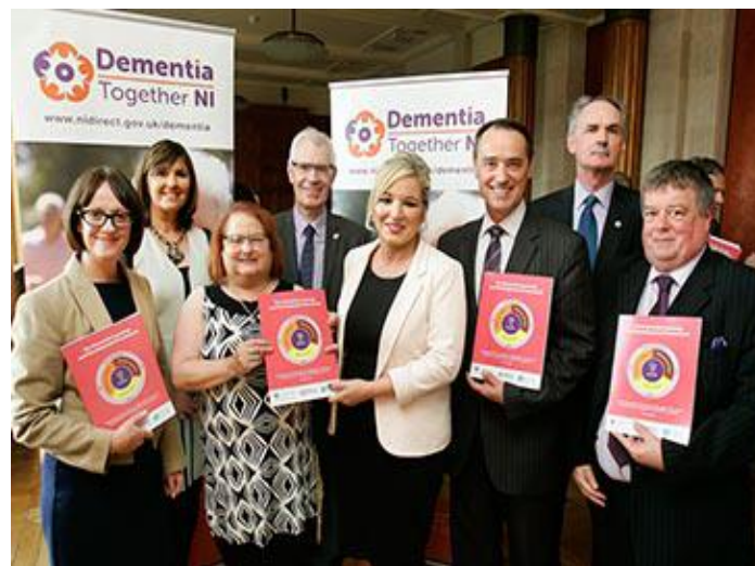
Health Minister Michelle O'Neill (centre) pictured with representatives from the Department of Health, The Executive Office, The Atlantic Philanthropies, Health and Social Care Board, Public Health Agency and Dementia NI