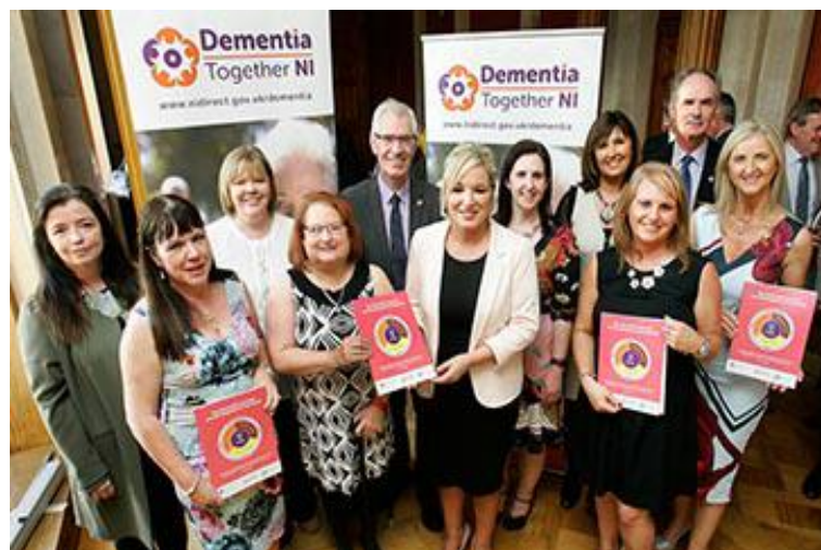
Health Minister Michelle O'Neill (centre) pictured with members of the Steering Group of Dementia Together NI and the Framework Stakeholder Group

Speaking at the launch, Minister for Health Michelle O'Neill said she hoped: "the Framework would provide an assurance to the public that staff caring for those living with dementia have the right knowledge and skills to do their job well, to challenge the stigma that exists around dementia, and to improve communication skills with people with dementia."