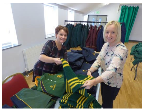
Lisburn YMCA and Bryson supported families attending the fairs to prepare to return to school