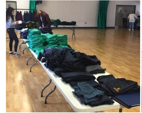
Hundreds of donations were contributed to this project from April to July 2017 from families and schools