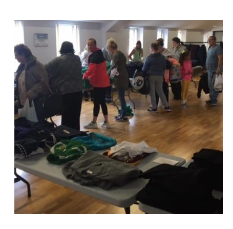
126 families attended the Back to School fairs. One parent said 'This is a brilliant idea and has been a

brilliant idea and has been a fantastic help! I am very happy today!'