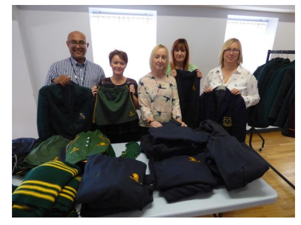
CYPSP Down Locality Planning Group members supporting families at the Ballymote Back to School Fair, July 2017