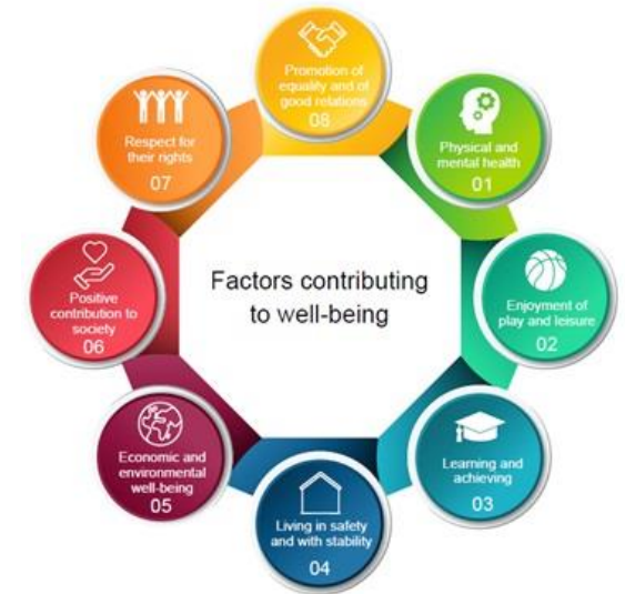
Figure 3 Eight high level outcomes of the NIE Children and Young People's Strategy for Northern Ireland, 2017-2027

This Children and Young People's Strategy 2017-2027 for Northern Ireland is designed to improve the well-being of all children and young people living in Northern Ireland.