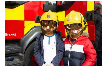
Intergenerational Family Fun and Safety Day on 23 March 2019

All people in Ards and North Down fulfil their lifelong potential